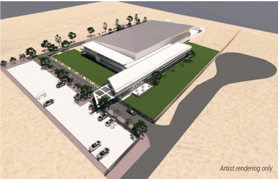
Artist rendering only

It was the intention of the Government of Namibia, through the ODC, to establish a pharmaceutical manufacturing facility in Namibia for the production of generic medicines for human consumption. With this project they wished to promote the development of the pharmaceutical manufacturing industry in Namibia. It would also have advantages for the Namibia economy not only relating to import substitution, regional export promotion, job creation and skills development, but also stimulating the development of research capacity and initiatives in order to facilitate the establishment of a pharma-tech industry in Namibia. This would be in line with stated Vision 2030, Growth at Home as well as the Harambee Prosperity Plan objectives.